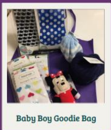
Baby Boy Goodie Bag