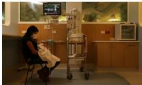
New Mum with son at NICU

The Neonatal Intensive Care Unit (NICU) at John Hunter Children's Hospital received a box of goods suitable for newborns and their mums. Knitted hats, plush toys, soft socks were delivered to the ward by our staff member. Her daughter worked closely with the unit and knew it would be an ideal opportunity for our Staff Giving Program.