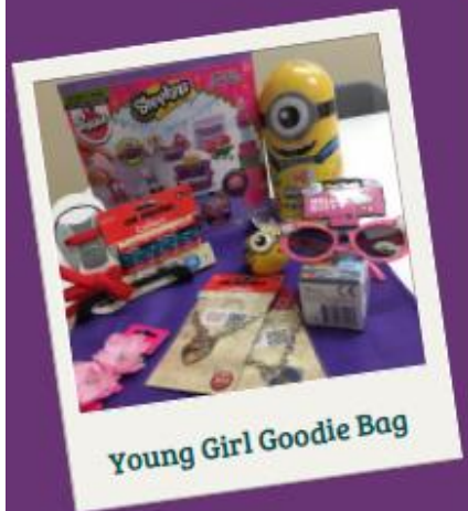
Young Girl Goodie Bag