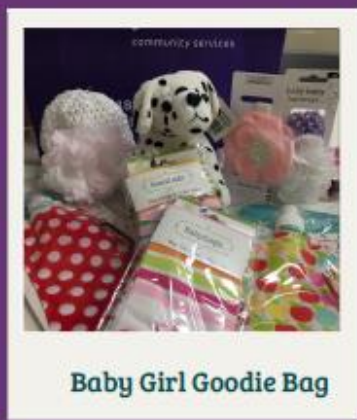
Baby Girl Goodie Bag