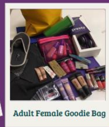
Adult Female Goodie Bag