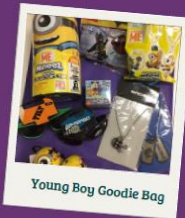
Young Boy Goodie Bag