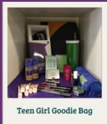
Teen Girl Goodie Bag