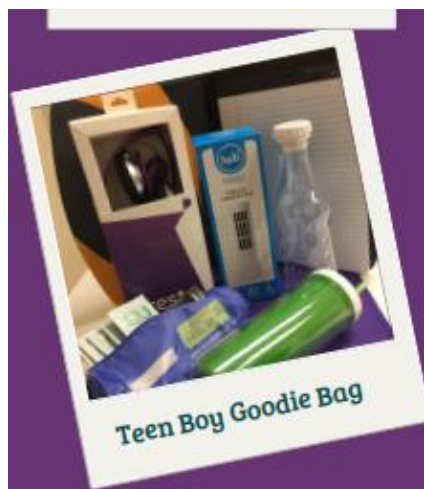
Teen Boy Goodie Bag